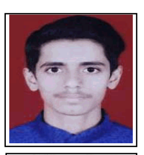
Md Day AKNOT.

MUKHERJEE ROAD, Ph 9903889424/7439350720