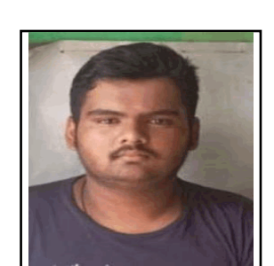
Suyey kumzı Handas