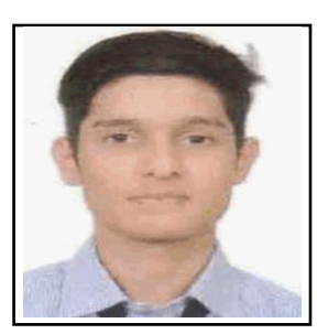
Ho Stomed Kine